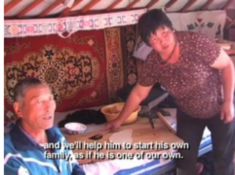
and we'll help him to start his own family as if he is one of our own.