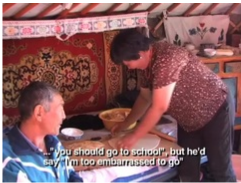
... "you should go to school", but he'd say "I'm too embarrassed to go"