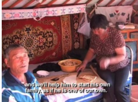
and we'll help him to start his own family as if he is one of our own.