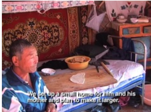
We set up a small home for him and his mother and plan to make it larger.