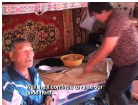
Well, he'll continue to raise our good herd...