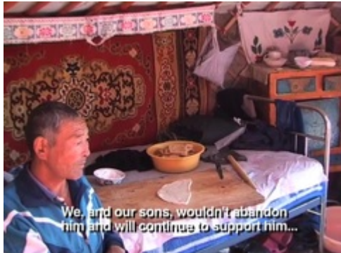
We, and our sons, wouldn't abandon him and will continue to support him...