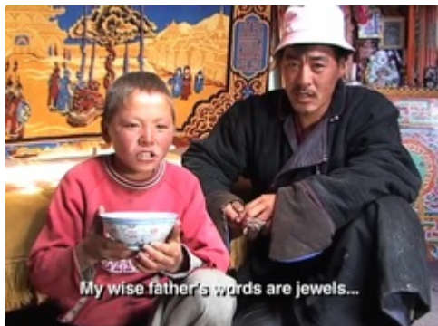
My wise father's words are jewels...