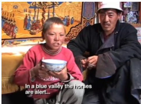
In a blue valley the nurses are alert...