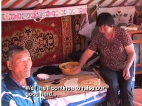
Well, he'll continue to raise our good herd...