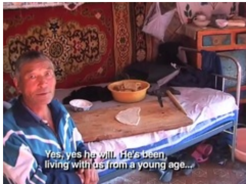
Yes, yes he will. He's been living with us from a young age...