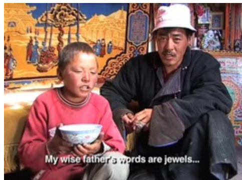
My wise father's words are jewels...